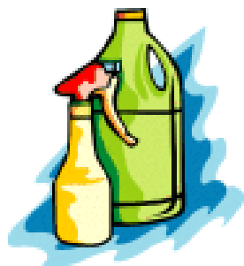
Household cleaners submerged in water are just one example of a potential contaminant

All homes and businesses, due to their connection to our water system, are potential cross-connections. The water pipes and fixtures contained within your home or businesses may act as a conduit for contaminated or polluted water during conditions known as backflow .